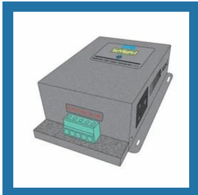
Multifunction Solar Charge Controller