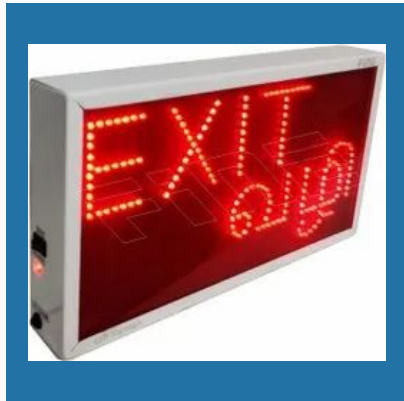
Fine LED Exit Sign 3016 with Battery Backup