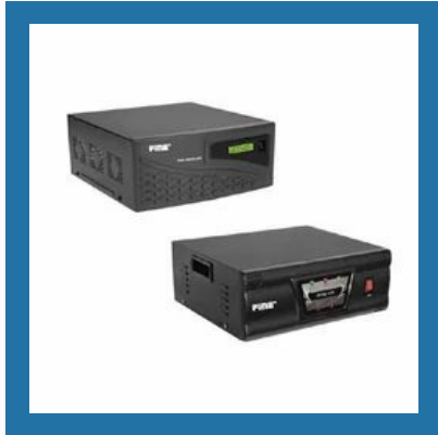
Fine hybrid solar inverter 3kw