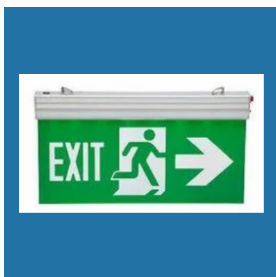
Fine LED Edge Light Edge Lite 3516 Double Face With Battery Backup