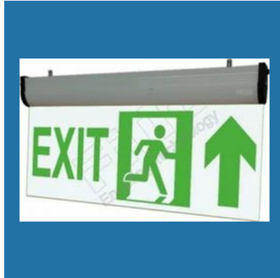
Fine Led Exit Light Edge Lite 3516 With Battery Backup