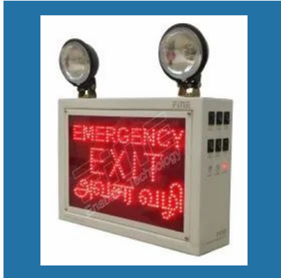
Fine Industrial Emergency Exit Light With LED Sign