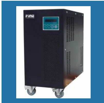
Home Ups Inverter