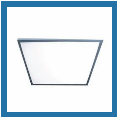
LED Panel Light