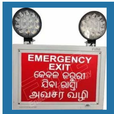
Fine Industrial Emergency Exit With Back Light Sign