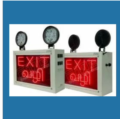
Fine Industrial Emergency Exit Light Double Face With LED Sign