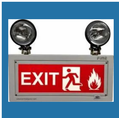
Double Beam exit light