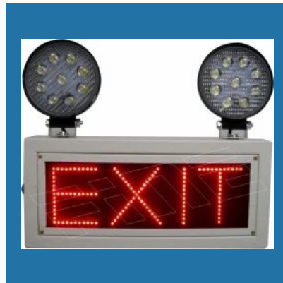
Exit LED Lights