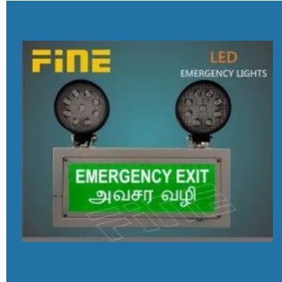
Fine Industrial Emergency Light With LED Exit Back Light Sign