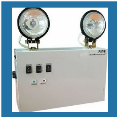
Fine Industrial Emergency Light 110W Halogen With Battery Backup