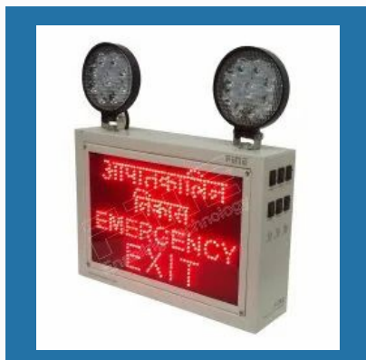
Fine Industrial Emergency Exit Light With LED Red Sign