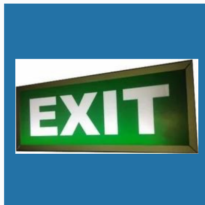
Fine Exit light Back lite 3016 AC