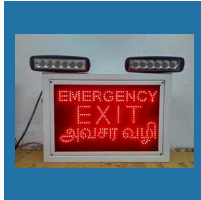
Industrial Emergency Light IEL- EEA36L