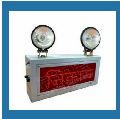
Fine Industrial Emergency Exit Light with LED Red Sign