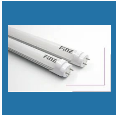
LED Tube Light