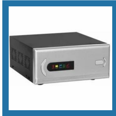
Solar Off Grid PCU Inverters