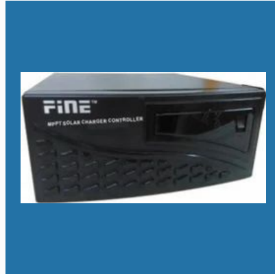
MPPT Solar Charge Controller