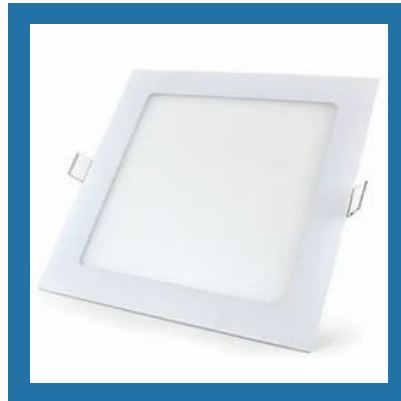
LED Surface Panel Light