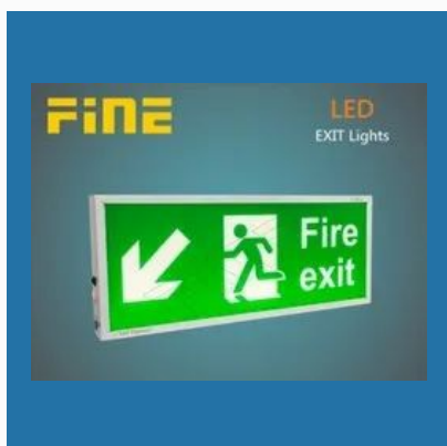
Fine Exit Light Back Lite 4016 With Battery Backup