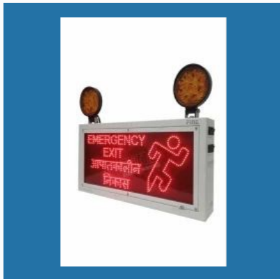
Fine Industrial Emergency Exit Light with LED Sign