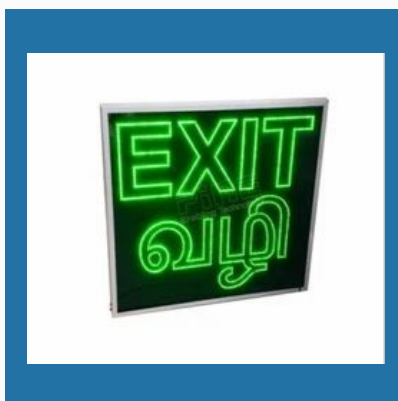
Fine LED Exit Sign 6760 with Battery Backup