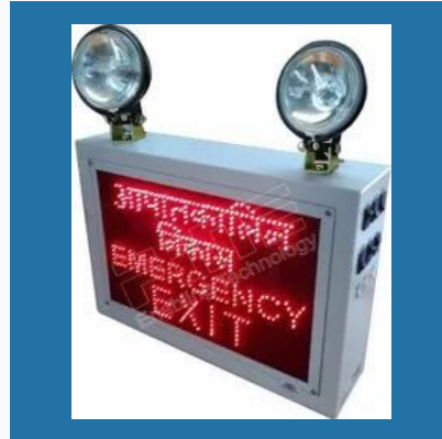
Fine Industrial Emergency Exit Light With LED Sign