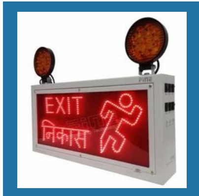
Fine Industrial Emergency Exit Light with LED Sign