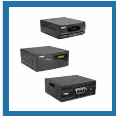
Home Ups System