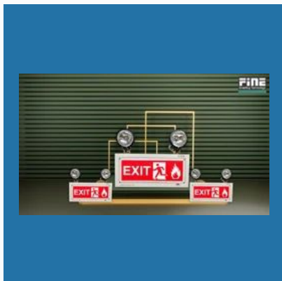
Fine Industrial Emergency Light With LED Exit Back Light Sign