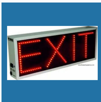
Fine LED Exit Sign 3011 with Battery Backup