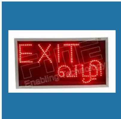
Fine LED Exit Sign 3016 with Battery Backup