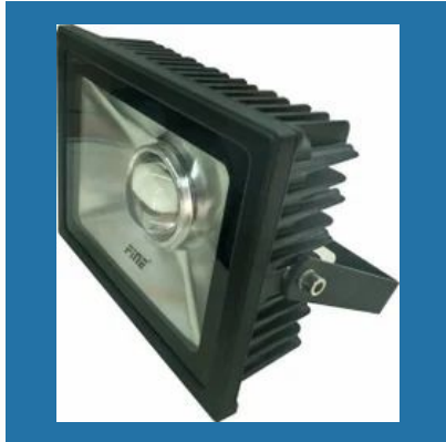
50 W LED Flood Light