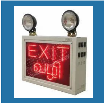
Fine Industrial Emergency Exit Light With LED Sign