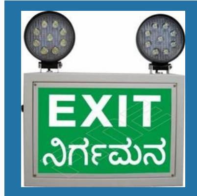
Exit LED Lights