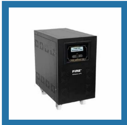
High Power Single Phase UPS Inverter