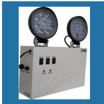
Fine Industrial Emergency Doom light 18W LED With Battery Backup