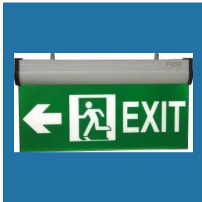
Green Exit Light