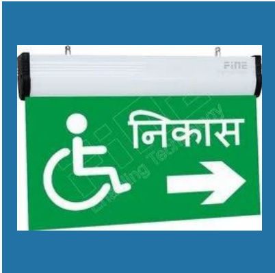
Fine LED Edge Light Edge Lite 3016 Double Face With Battery Backup