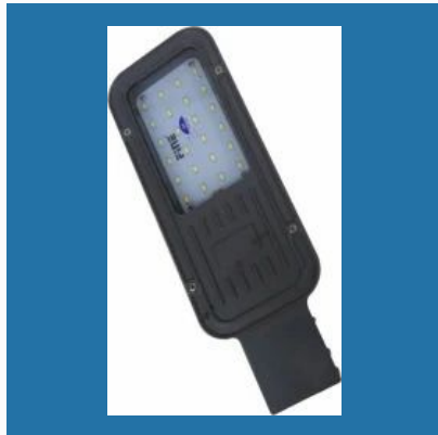
10W LED Street Light