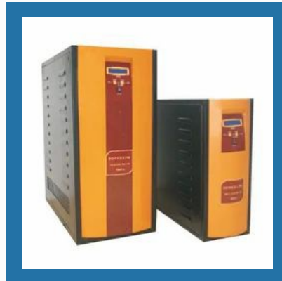
Online UPS System