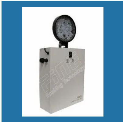
Fine Industrial Emergency Light Single Doom 9W LED With Battery Backup