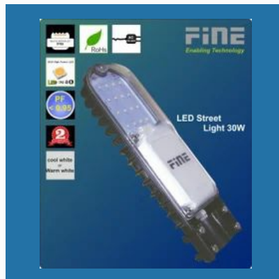
LED Street Light 30W