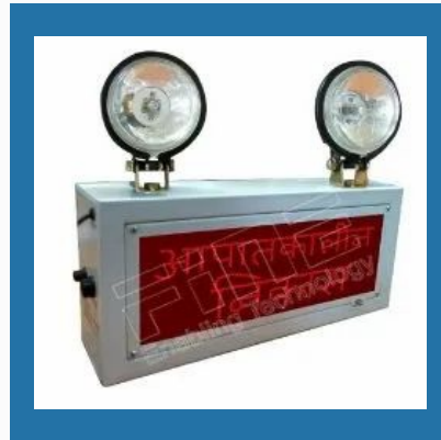
Fine Industrial Emergency Exit Light with LED Red Sign