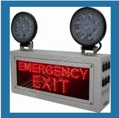
Fine Industrial Emergency Exit Light With LED Red Sign