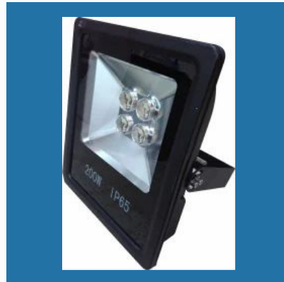
10 W LED Flood Light