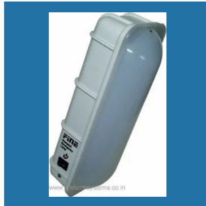
Compact Emergency Light - 5E