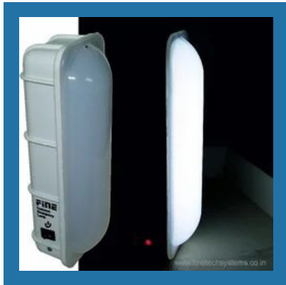
COMPACT EMERGENCY LIGHT - 5