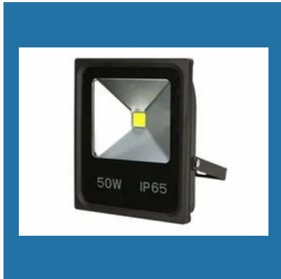
20W LED Flood Light