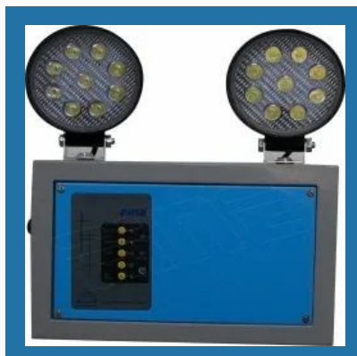
Fine Industrial Emergency Light 18I LED With Sensor Micro Touch Switch