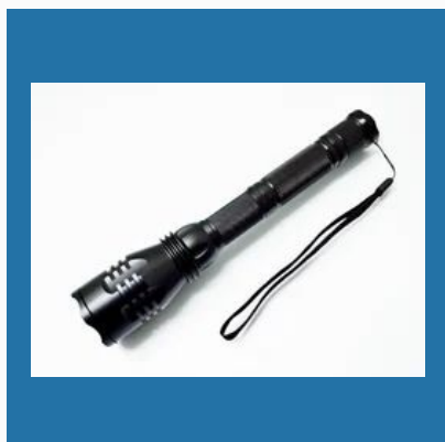
Portable LED Torch