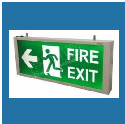
Fine Exit Light Back Lite Double Face 4016 With Battery Backup