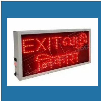
Fine LED Exit Sign with Battery Backup