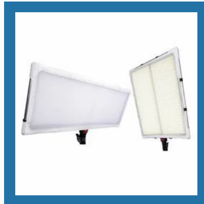
LED Digital Panel Lights