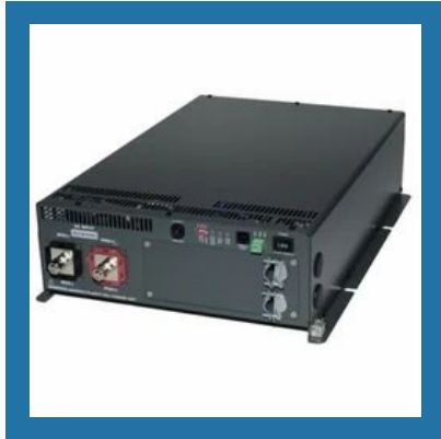
On Grid Solar Inverters