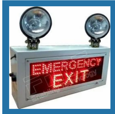
Fine Industrial Emergency Exit Light with LED Red Sign