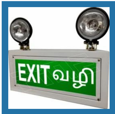
Exit Display lights