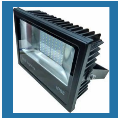
90W LED Flood Light