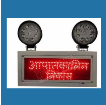
Fine Industrial Emergency Exit Light With LED Sign