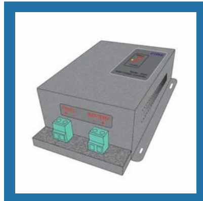
Solar Charge Controller