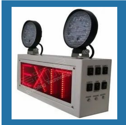
Fine Industrial Emergency Exit Light With LED Red Sign