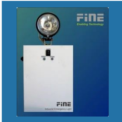
Industrial Emergency Light BCH 55