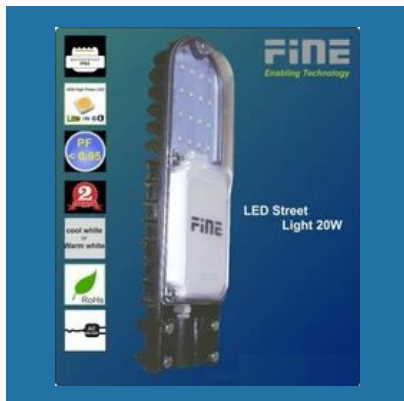
LED Street Light 20W