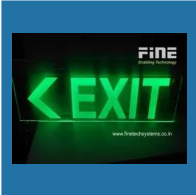
Fine LED Exit Light Edge Lite 3016 With Battery Backup