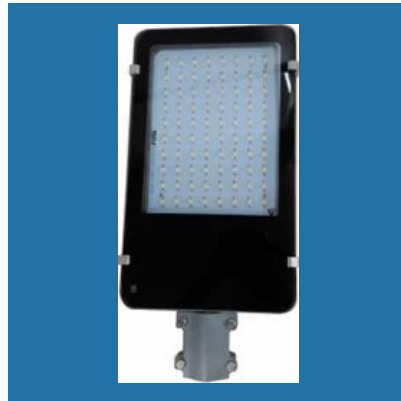
FINE 90W LED Street Light