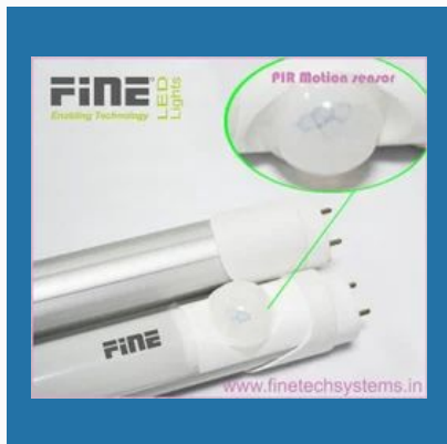
LED Motion Sensor Tube Light