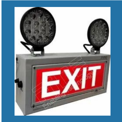
Fine Industrial Emergency Light With LED Exit Back Light Sign