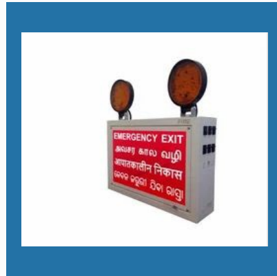
Fine Industrial Emergency Light With LED Exit Back Light Sign