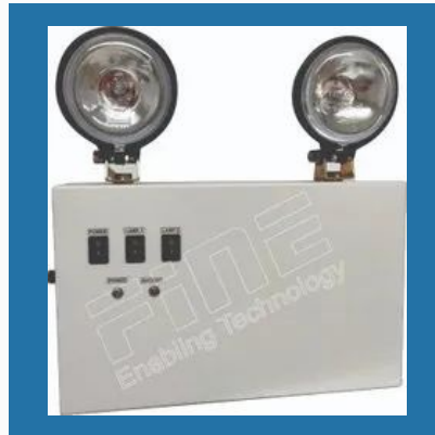
Fine Industrial Emergency Doom Light 110W Halogen With Battery Backup