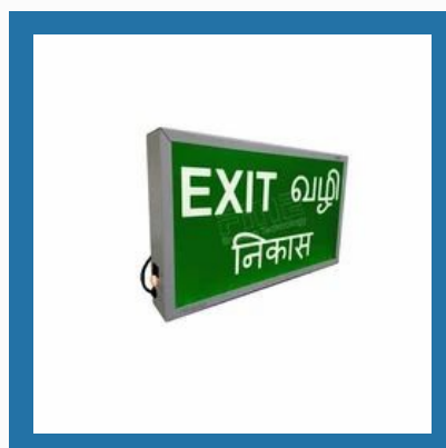
Fine Exit Light Back Lite 3011 With Battery Backup