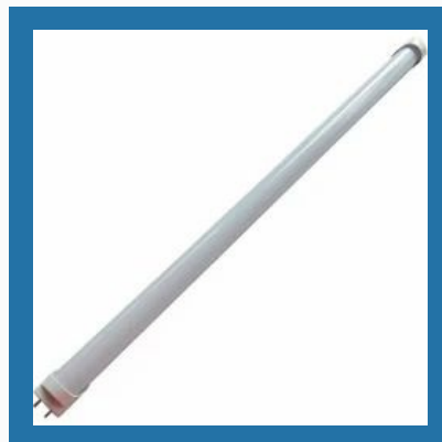
Plastic Carbonate LED Tube Light 16W