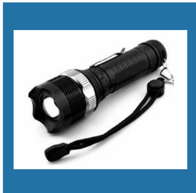
LED Rechargeable Torch