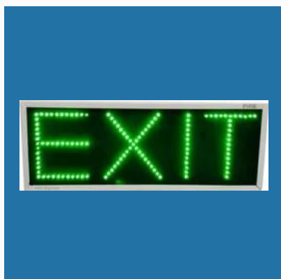
Fine LED Exit Sign 3011 with Battery Backup