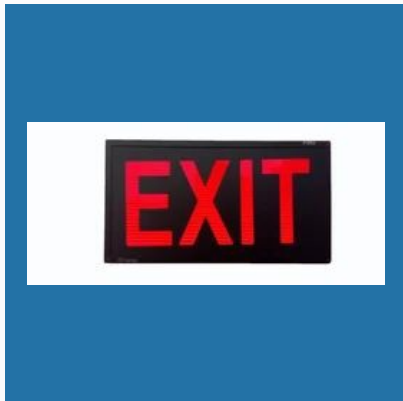
Fine Back Light sign 3016