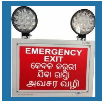
Emergency Exit Lights